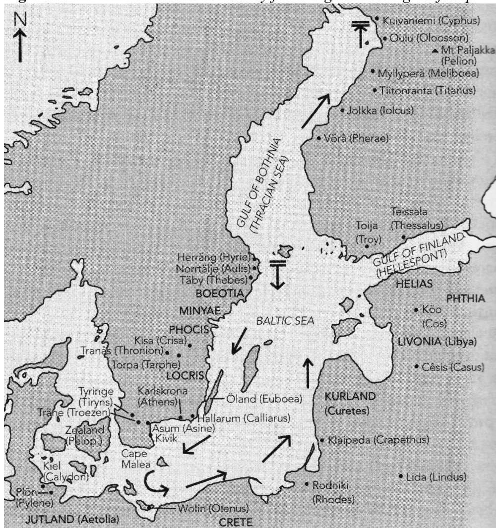
Figure 2. Homer's World in the Baltic by following the Catalogue of Ships